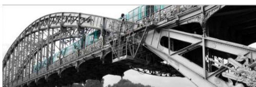
Projects : Oeuvres de genie

LV2: English or initiation into Portuguese or Italian for English speakers